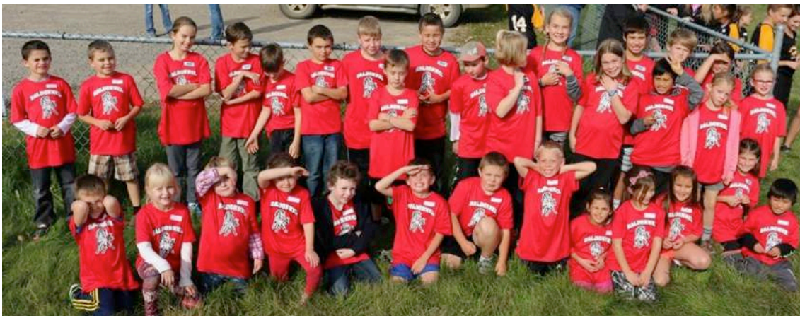
Race day at Upper Pine School – September 28 th .

Cross-Country Running – 32 students in Grades 1-6 joined the cross-country running team with Ms. Wright and completed two races in September. The final race will be held (weather permitting) on Oct. 12 at 3:00 pm at Kin Park. Primary students run 1.5 km and Intermediate students run a 2.5 km course. Our students have shown true Bronco spirit at the races and every single runner completed both races. Well done runners – we are very proud of your efforts.