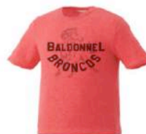
358 TEAM RED HEATHER