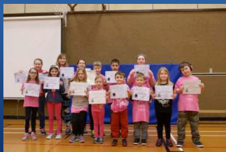
Recognition Awards for March