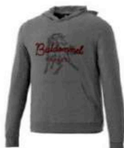
988 HEATHER DARK CHARCOAL