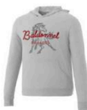
932 HEATHER GREY