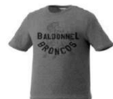
988 HEATHER DARK CHARCOAL