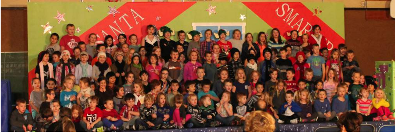
A very successful Christmas concert: “Is Santa Smarter ...?”

Thank you for your support of our Willow Chair fundraiser. We raised over $1000 for literacy programs at the school.