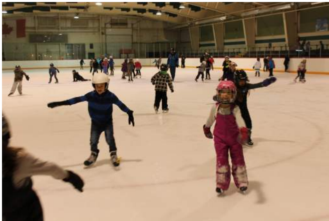
Skating at the Taylor Arena on December 18 th .